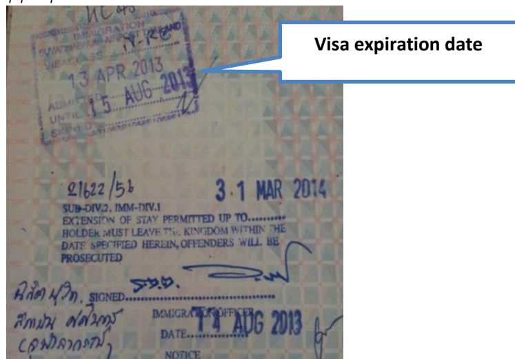
The example of Visa expiration date

Notation: Student must apply in person at the Immigration Bureau (Chaeng Wattana) before the visa expiration date and it is the responsibility of individual student to follow visa expiration date and make appropriate extension on time.