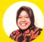
Dr. (H.C.) Ir. Tri Rismaharini, M.T.* Surabaya City Mayor *in confirmation